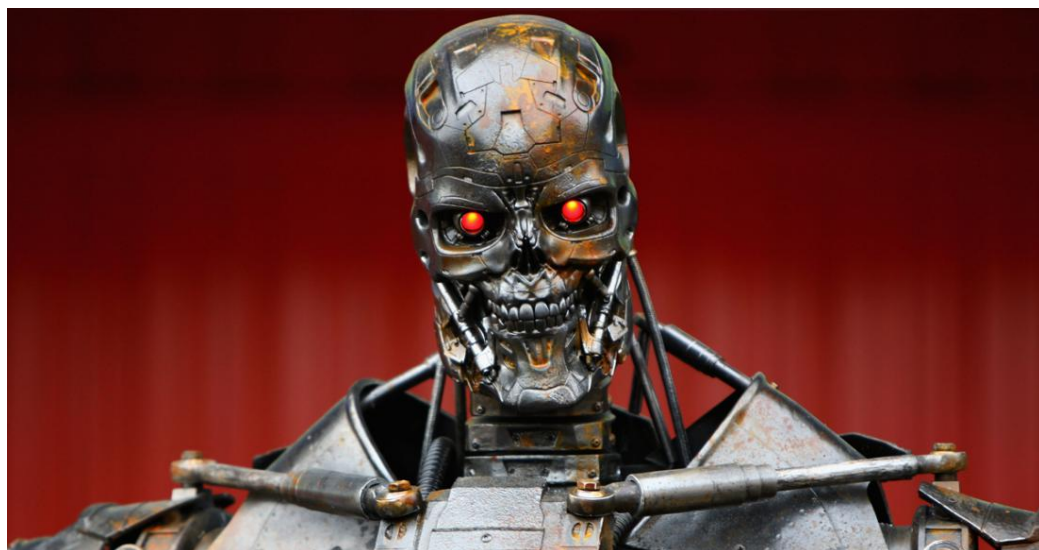
Figure 1: An increasingly popular image of the future of AI

A fourth reason extreme claims about AI have become commonplace is that an intensely competitive environment for media attention rewards sensational material with more social media likes, retweets, and other forms of viral amplification. This is why when Time magazine publishes an article on “What Seven of the World’s Smartest People Think