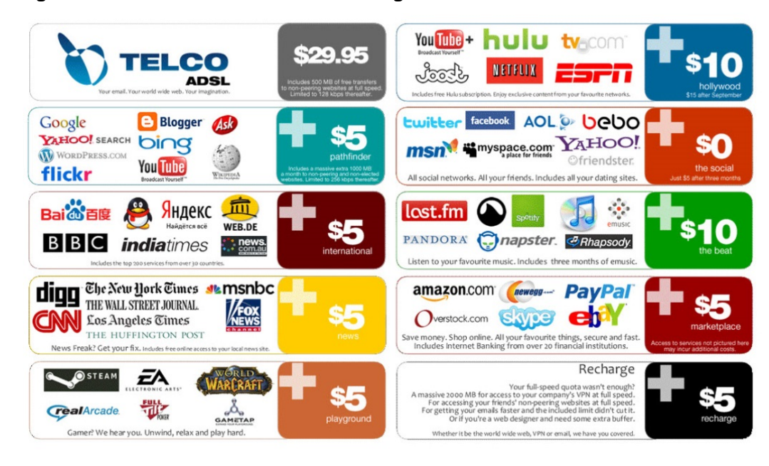
Figure 4: Mock "cable-ized" Internet advertising sheet<sup>62</sup>

Indeed, a balanced approach to net neutrality can ensure the best outcomes in quality of service on the Internet. The FCC should have the statutory teeth to protect consumers from discrimination, blocking, and throttling of online services. But net neutrality rules should not force ISPs into a regime that bars them from innovating or allowing third parties to voluntarily pay for prioritized service, especially for applications that currently do poorly on the best-efforts Internet. Similarly, rules should allow for flexible business arrangements such as zero-rating plans, where mobile broadband consumers can use certain apps without these apps counting against their monthly data usage. Such arrangements are likely to benefit low-income cell-phone users. Policymakers should look to light-touch regulations that arm the FCC with the ability to regulate against unreasonable agreements or actions by ISPs while allowing innovations that benefit consumers and businesses.