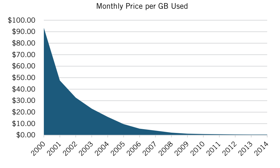
Figure 3: Monthly price per GB used<sup>39</sup>

In a 2015 note to investors, New Street Research argued that broadband was mis-priced and should be more expensive relative to cable companies' video offerings.<sup>40</sup> While the price of an average broadband connection has remained relatively steady, analysts pointed to the increase in output in the form of higher speeds.<sup>41</sup> This increase in broadband speeds