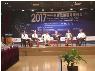
Shanghai Summit 2017