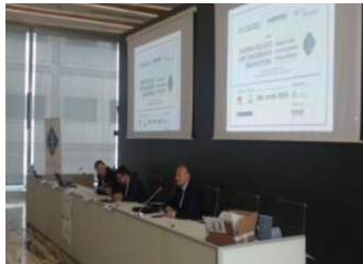
Milan Summit 2018